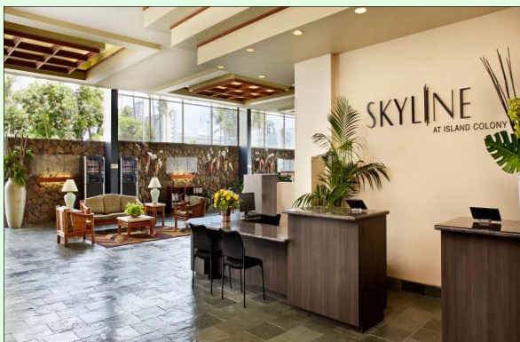
Above - Skyline at Island Colony's spacious and beautiful open-air lobby