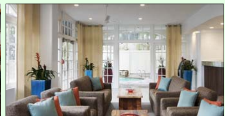
2017 Comp set hotels include - clockwise from top right: OHANA Waikiki Malia and Joie de Vivre Coconut Waikiki Hotel, Ilima Hotel, Hyatt Place Waikiki Beach, Aqua Pacific Monarch