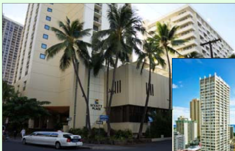
Skyline's competitive set of hotels for 2016 remain the same as 2015. L-R Hyatt Place Waikiki Beach, Aqua Pacific Monarch, OHANA Waikiki Malia, Ilima Hotel and Joie De Vivre Coconut Waikiki Hotel

Aqua Skyline at Island Colony finished the month of February at 94.0% compared to our competitive set at 84.2%. While Pro Bowl provided a boost at the start of the month, demand remained soft for remainder of the month, with the exception of the Presidents' Day/Valentine's Day long weekend. Rates were significantly reduced to fill occupancy. Although we fell short of budget goals, pick up in the month was great as we were able to do what was needed to fill rooms.