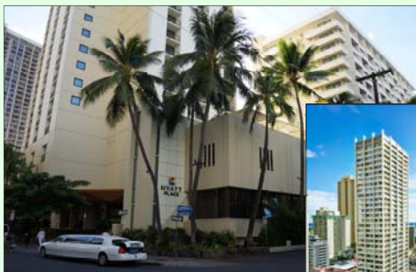
2017 Comp Set = similar competitor hotels including Hyatt Place Waikiki Beach, Aqua Pacific Monarch, OHANA Waikiki Malia, Ilima Hotel and Joie De Vivre Coconut Waikiki Hotel)

Aqua Skyline at Island Colony finished the month of January ahead of revenue goals. Occupancy was 94.1% for the month, which also exceeded budget. The high occupancy provided the base we needed to exceed our monthly budgets. In the month, we had great last minute pick up in the month that was projected to be on a decline compared to previous years.